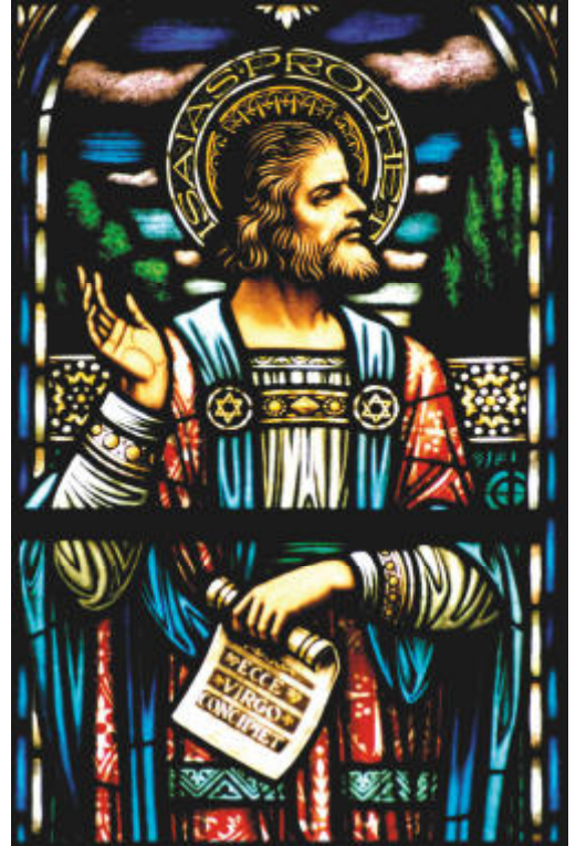
Isaiah the Prophet St. Philip Catholic Church Litchfield, MN

Important Elements of Advent. The symbol of the Advent season is the Advent Wreath comprised of four candles, three which are violet or purple, one which is rose, and represents the increasing light of Christ, the light of the world, born at midnight, during the time of the approaching winter solstice and the shortest and darkest day of the year. The saint of Advent is St. John the Baptist , the intertestamental prophet who bridged the Old and New Testaments, the one who foretold his coming, proclaimed his presence when he came, and challenged the people of his time and people of our day to open their hearts to receive Christ. The prophet of Advent is Isaiah , the author of the Immanuel Prophecies (Is 7:10-14; 9:1-6, especially vv, 5-6; and 11:1-10), quoted with seven Scripture passages used for the Sundays of Advent, seventeen for the weekdays of Advent, and every day for the Office of Readings.